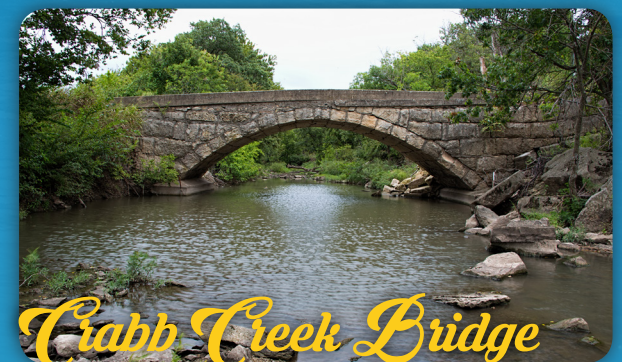
Crabb Creek Bridge