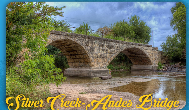
Silver Creek Andes Bridge