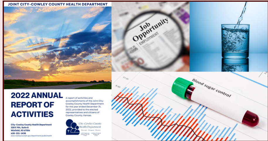
2022 ANNUAL REPORT OF ACTIVITIES A report of activities and accomplishments of the Joint City-Cowley County Health Department for the year ended December 31, 2022, provided to the elected representatives and citizens of Cowley County, Kansas.

Our 2022 Annual Report is finished and ready for you! This report provides an overview of some of our achievements, milestones, and activities last year. Our Annual Report is about celebrating community support and giving the public a look at all the ways we work hard to help you stay well! As with 2021's Annual Report, the 2022 Annual Report will be available in our new online presentation format! Visit our website to access pdf copies of both the full-color and print-friendly versions.